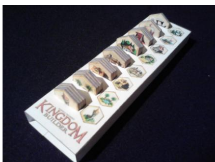
The finished product.

A simple token holder box designed to hold the pieces in the slots.